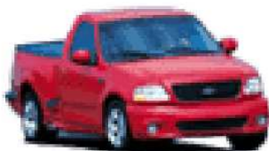
A Pick up truck or Van