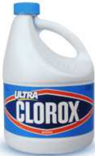
Bleach, any brand?