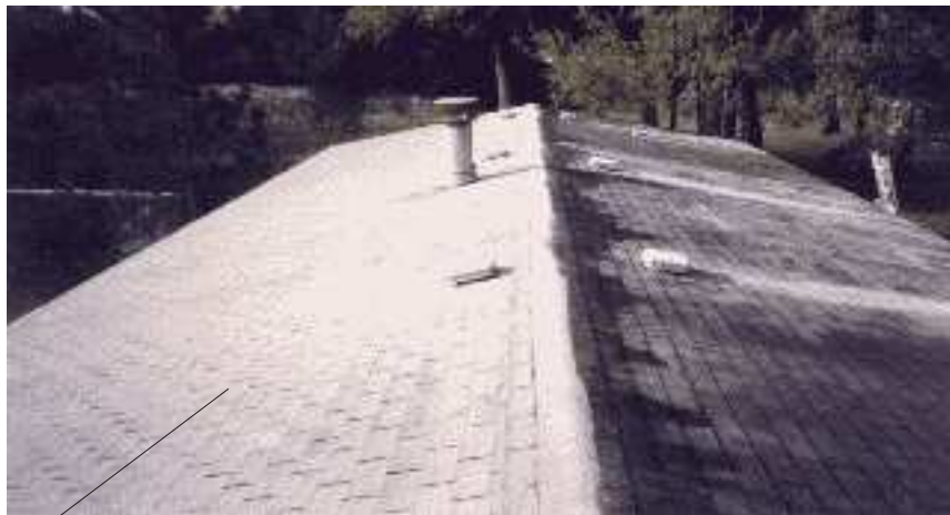
Side cleaned with Clorox Bleach